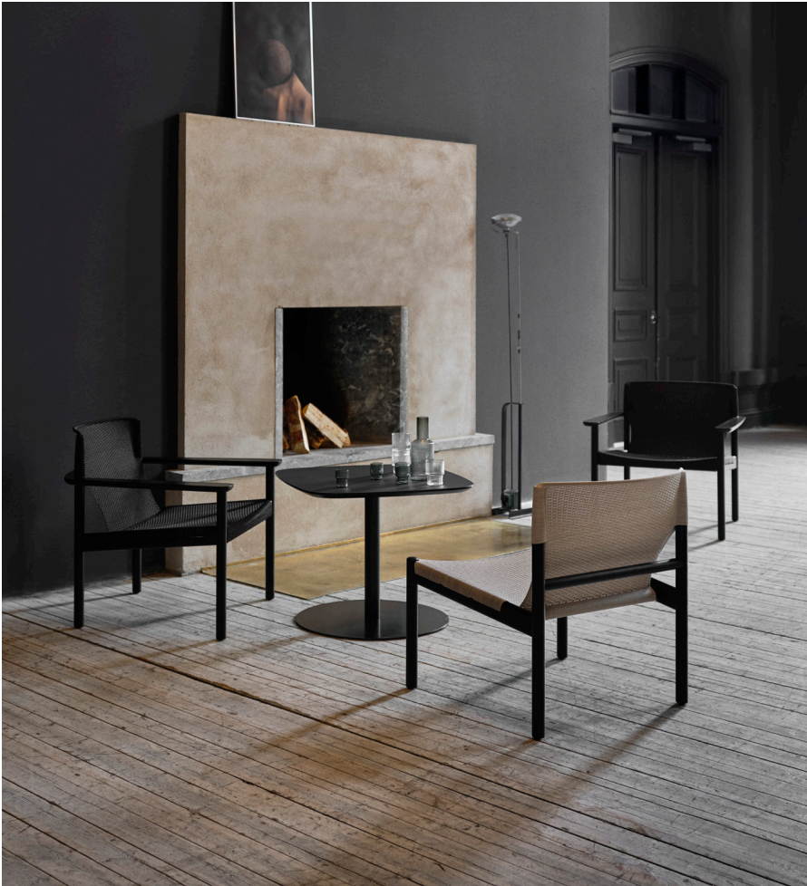
All finishes of wood and fabric colours can be combined.