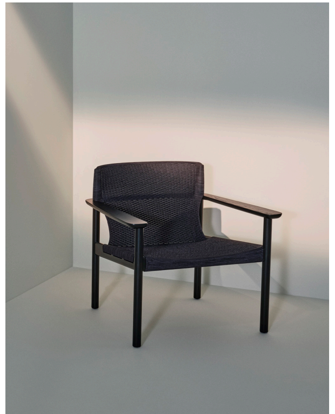
The seat and back are made of a single piece of 3D-knitted fabric. Colours Beige Melange and Black Melange.