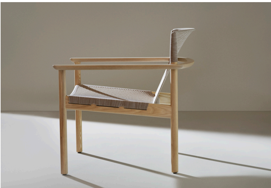
Evo is made of wood, in ash, oak or black-stained ash finishes. The chair is available with or without armrests.