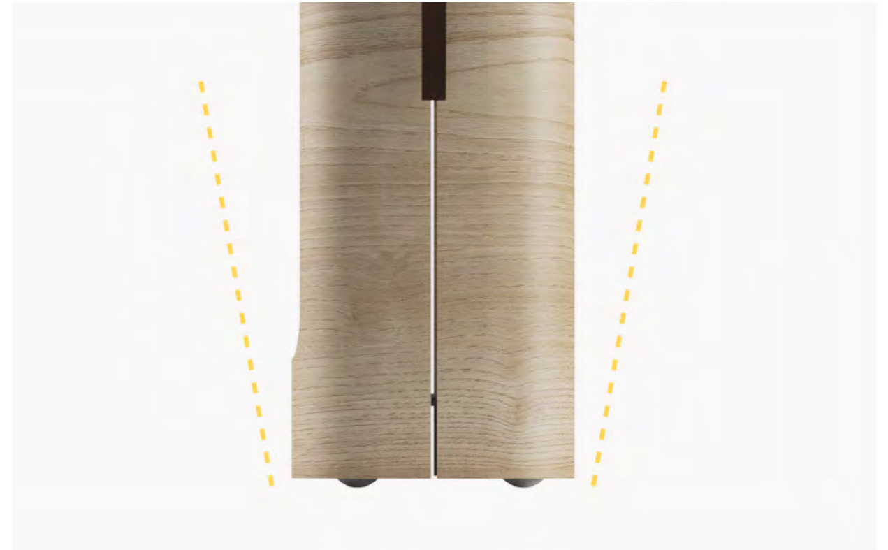
Ingenious Anti-tipping Structure